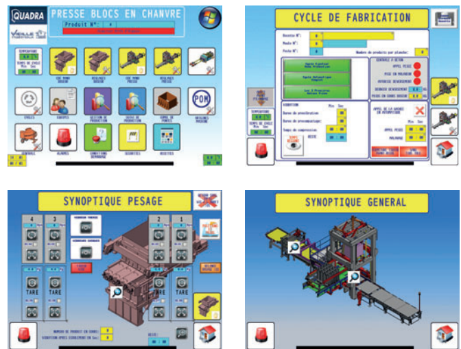
A touch screen terminal allows the adjustment and viewing of all parameters. A clear, intuitive and user-friendly interface allows easy modification of the block machine settings without interfering with the production.