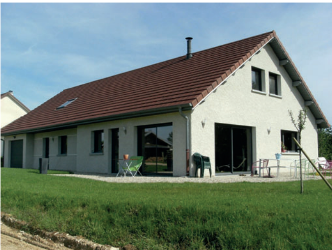
Hemp blocks called "Biosys": innovative building solution allowing fast and simple use.