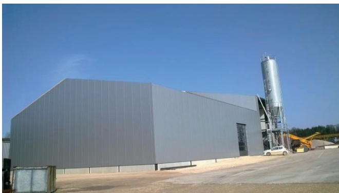
Vieille Matériaux manufactured a complete plant based in Mérey-sous-Montrond, dedicated to the production of hemp blocks.

Hemp is a renewable and recyclable material. It does not require weed killer, irrigation or phytosanitary product and has a very low ecological impact. Mixed with fast-setting cement without admixtures (natural cement provided by the Vicat Group ) it weighs the same as a classic material, but requires only 5.4 blocks per square metre. The hemp block uses a binder that has been adapted and manufactured for more than 150 years in Massif de la Chartreuse. Its mineralogical composition has all the required qualities for the perfect formulation of the Biosys and its durability.