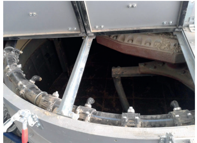
Mixer type OMG P1000.

Like all other batching plants designed and installed by Quadra, all the equipment provided is galvanised in order to increase its durability and minimize maintenance.