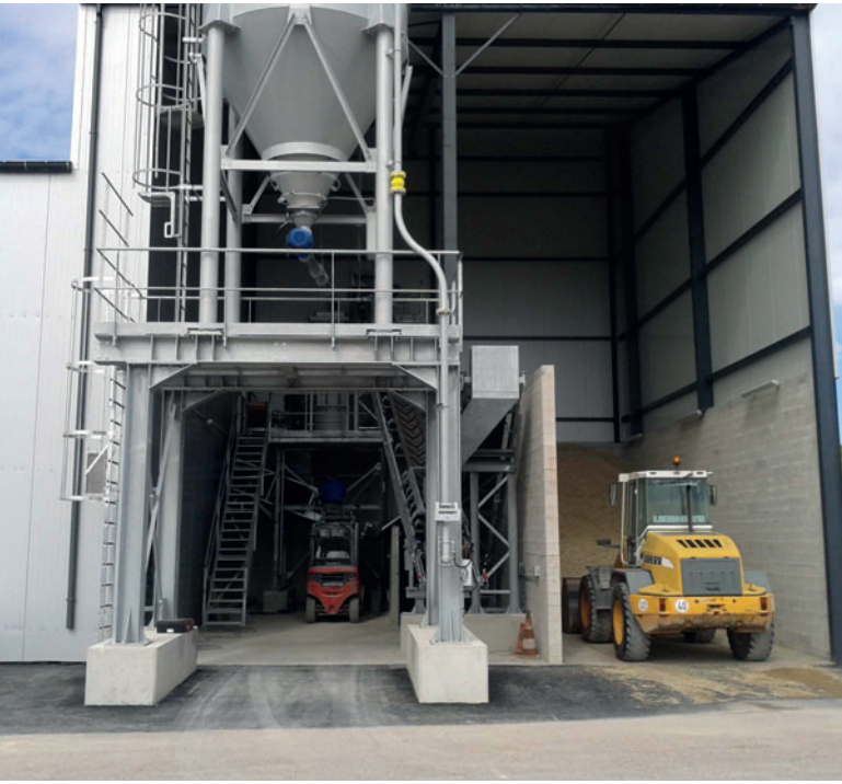
The hemp is stored in a box.