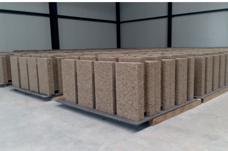
Hemp blocks during curing

A touch screen terminal allows the adjustment and viewing of all parameters. A clear, intuitive and user-friendly interface allows easy modification of the block machine settings without interfering with the production.