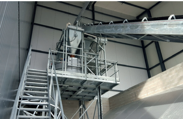
The hemp is transported by 2 conveyor belts equipped with strips.